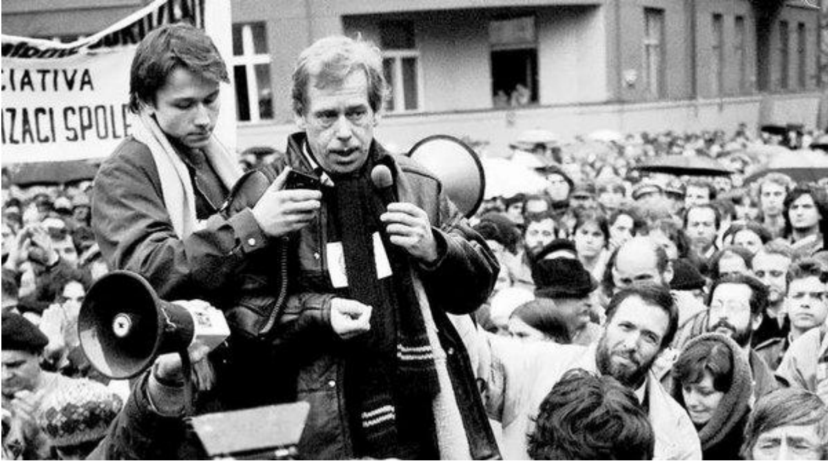
Vaclav Havel, the first president of the Czech Republic, leads protests during Prague's 1989 Velvet Revolution. The demonstrations are the focus of "The Power of the Powerless," a new documentary at Circle Cinema.